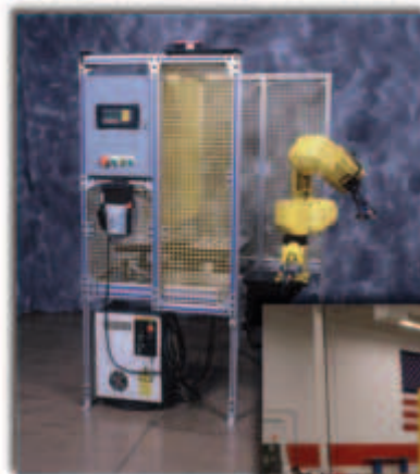
RoboFlex™ I - Automatic Pallet Loader

Productivity has many success stories that demonstrate how robotics has been integrated into daily manufacturing life. A case in point involves a contract manufacturer in central Minnesota. Productivity added a simple robotic loader to an existing process that wasn't producing as many parts per day as was originally expected due to extra inspection, de-burring, and cleaning required by the cell operator. This robotic loader took over the load/unload task of this operation, freeing up the operator to complete the extra tasks. The production rate also