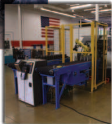
RoboFlex™ II - Mid-Size Part Handling